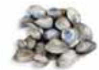
ARTIC SURF CLAMS Macromeris polynyma

Some stocks of Redlist species may be fished or farmed more sustainably than the general practice— for example, swordfish which is harpoon-caught instead of caught using longlines. In such cases, retailers should ensure that these more sustainable choices are fully traceable and labelled with catch method and exact origin. For more information about Redlist species, go to green-peace.ca/redlist