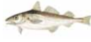
ATLANTIC COD Gadus morhua