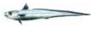
NEW ZEALAND HOKI Macruronus novaezelandiae