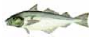
ATLANTIC HADDOCK (scrod) Melanogrammus aeglefinus