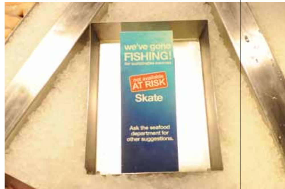
Tray that formerly held skate lies empty since Loblaw stopped selling it

Despite its strong points, including a deadline for full implementation and the fact that it applies to all products sold, across all banners, the policy has some major flaws. It identifies few criteria that the company will use to evaluate seafood, such as impacts of fishing or farming on other species or habitat, or type of fishing gear used. There is a heavy dependence on