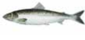
ATLANTIC SALMON (farmed) Salmo salar