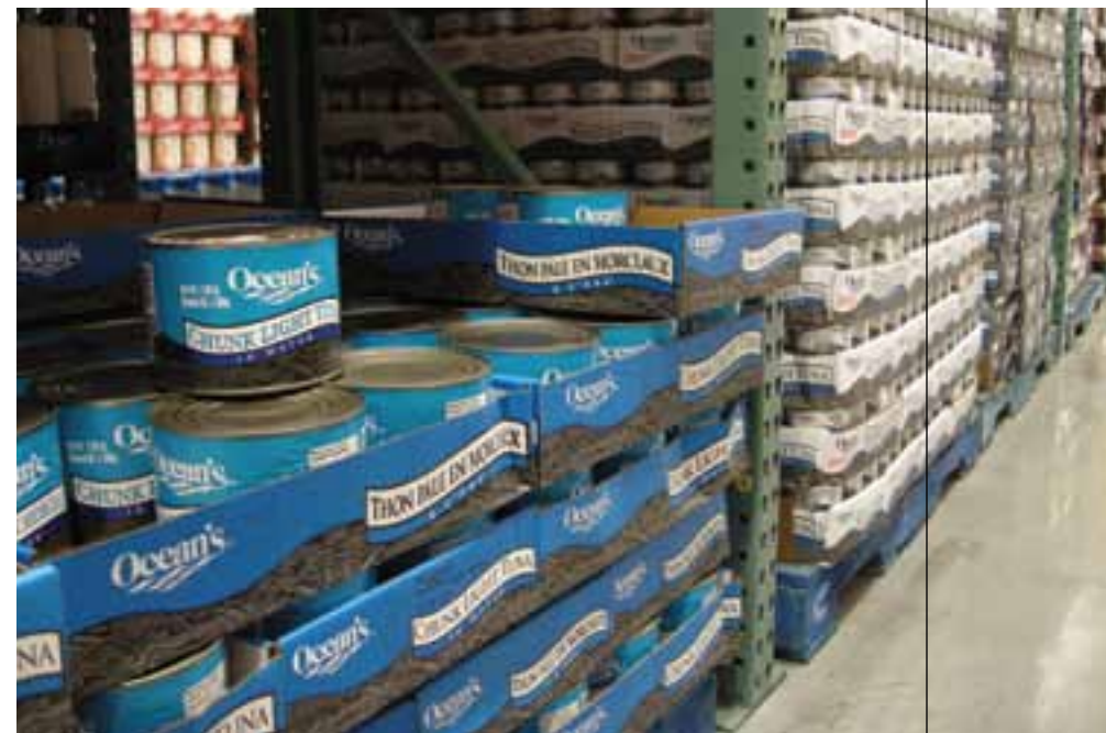
Tuna being sold like there was no tomorrow at Costco