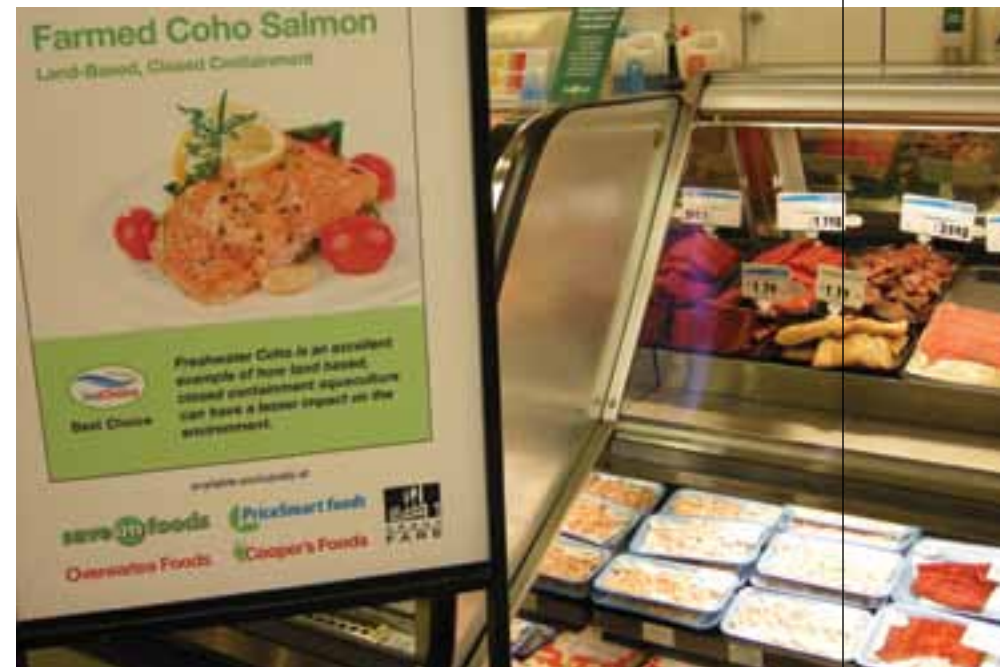
Land based, closed containment farmed salmon on promotion at Overwaitea

OFG has also taken steps to educate and train its staff on seafood sustainability issues, certification programs and assessments of various species by creating training programs and reference materials, including a Sustainable Seafood Reference Guide that contains detailed information on fish species sold in stores.