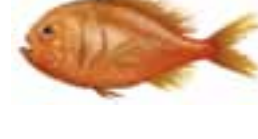
ORANGE ROUGHY Hoplostethus atlanticus