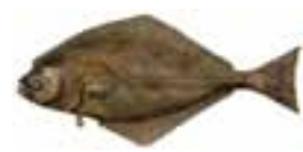
ATLANTIC HALIBUT Hippoglossus hippoglossus