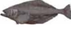
GREENLAND HALIBUT Reinhardtius hippoglossoides