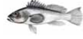
CHILEAN SEA BASS Dissostichus eleginoides