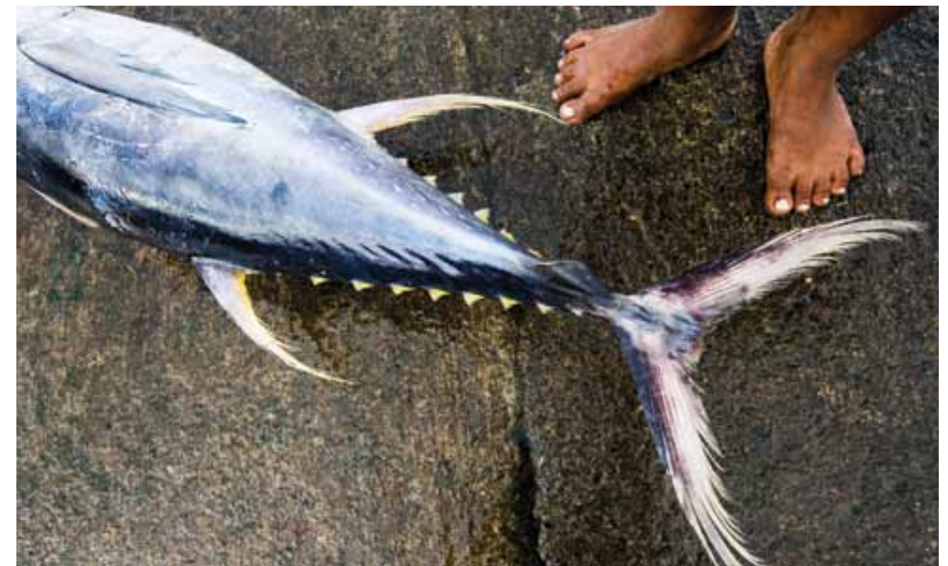
Yellowfin tuna in Honiara's market, Solomon Islands

In the UK, two retailers (Marks & Spencer and Sainsbury's) have moved to using exclusively pole-and-line caught tuna in their home brands. Sainsbury's brand tuna is currently sourced from pole-and-line fishery in the Maldives, each fish being landed individually. Because of the limited technology and investment required this fishing method allows for participation from coastal communities such as those in the Pacific and has the potential to create badly needed jobs.