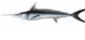
SWORDFISH Xiphias gladius