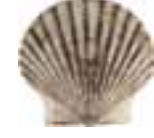
ATLANTIC SEA SCALLOPS Placopecten magellanicus