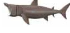
SHARKS (many species) Spurdog (piked dogfish, spiny dogfish) Squalus acanthias , porbeagle shark Lamna nasus , shortfin mako shark Isurus oxyrinchus , blue shark Prionace glauca ...