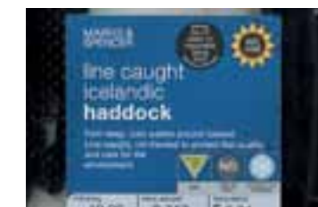
Examples of seafood labelling including common and scientific names, gear type and catch area.