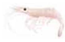
TROPICAL SHRIMP AND PRAWNS Penaeus spp