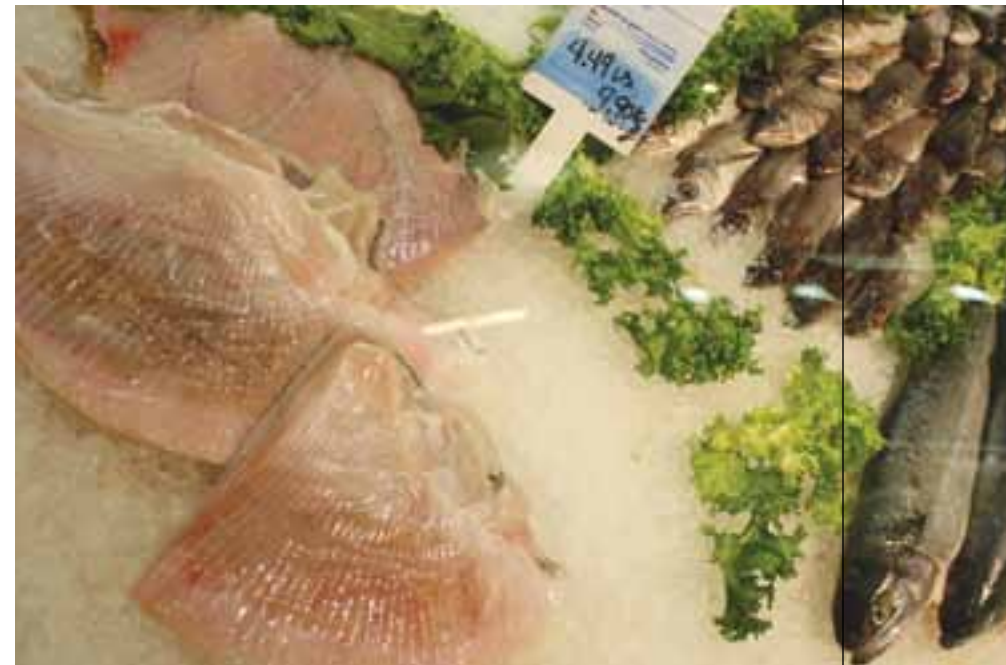
Skate on display at Sobeys just days before it was removed from sale

After two years of consulting an impressive list of stakeholders with the goal of developing a seafood sustainability policy, Sobeys has at last committed to completing and releasing a sustainable seafood policy in summer 2010. According to a letter received from Sobeys, the policy will include a focus on "improving the status and management plan of fisheries through engagement." Sobeys notes that it supports fisheries improvement projects such as initiatives targeting the Russian pollock and Newfoundland cod fisheries.