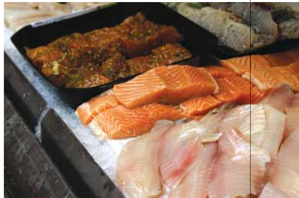
Metro fish counters still filled with Redlist seafood awaiting removal

Metro’s policy is innovative and covers important ground. It could benefit from greater clarity in its criteria, for example by detailing which fishing methods are to be avoided and which sought out.