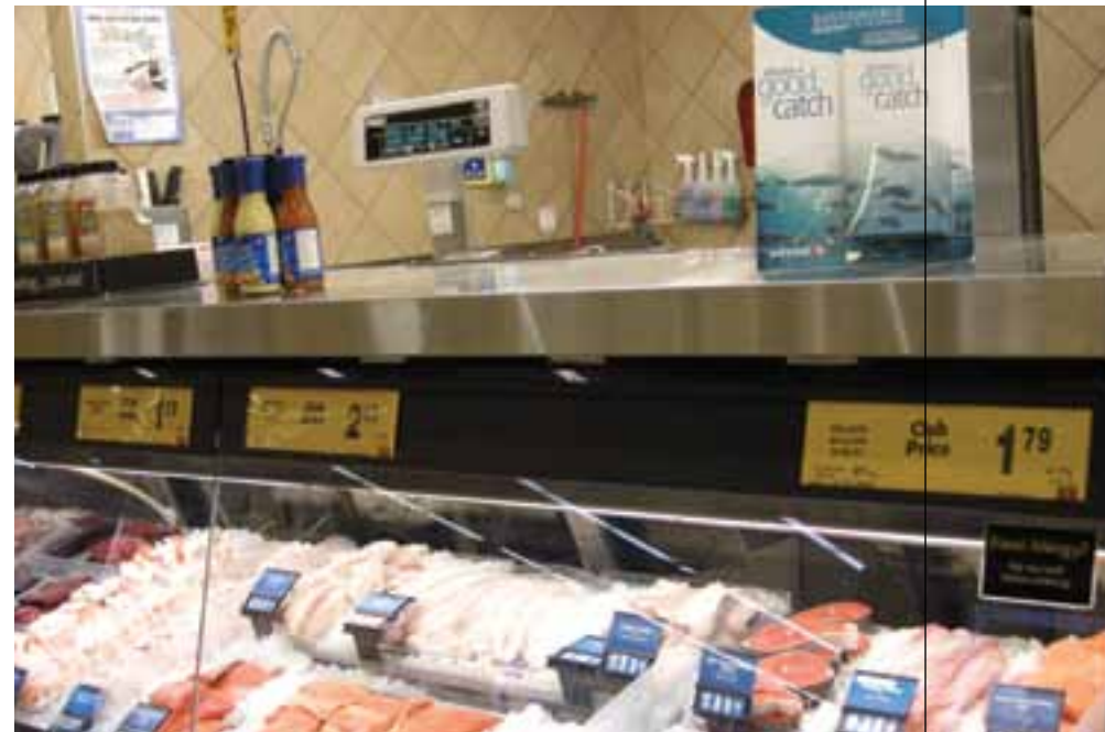
Safeway's fish counters provide pamphlets describing their seafood policy

In November 2009, Canada Safeway released a brochure in stores giving details of its seafood sustainability policy. The policy, modelled on the one released by Safeway US in March 2009, outlines the principles behind the chain's procurement strategy, which include: creation of an internal seafood taskforce charged with sustainable product procurement; communication of the policy to suppliers and the requirement of a sourcing assessment; an employee education program; and providing consumers with relevant information. The supplier sourcing assessment is aimed at identifying and screening out suppliers and products that do not meet the requirements of Safeway's policy. The company has stated that the policy will be fully implemented by 2015.