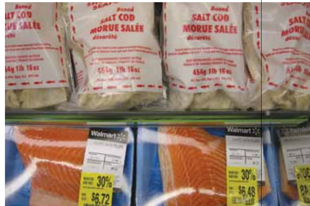
Farmed Atlantic salmon and Canadian Atlantic cod on sale at Walmart