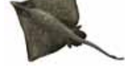
SKATES AND RAYS (many species) Thorny skate Amblyraja radiata , big skate Raja binoculata , longnose skate Raja rhina ...