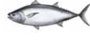
TUNA Atlantic bluefin Thunnus thynnus , yellowfin Thunnus albacares , bigeye Thunnus obesus